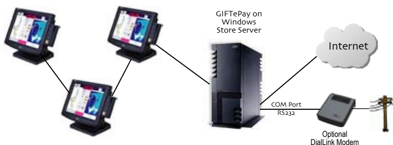
GIFTePay (3 lane configuration pictured)